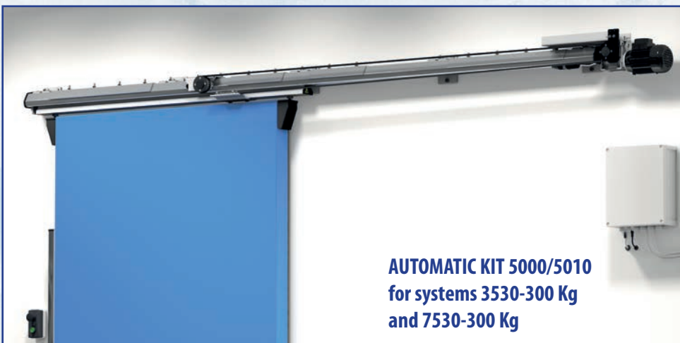
AUTOMATIC KIT 5000/5010 for systems 3530-300 Kg and 7530-300 Kg